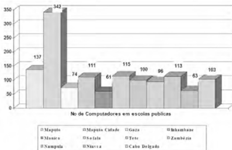
Figure 6.3: Number of computers in public schools per region